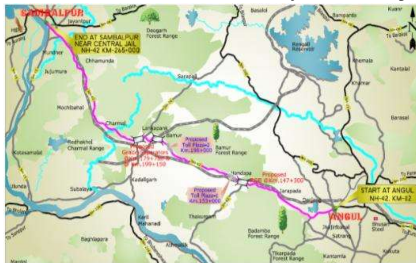
Fig.2: Project Corridor Angul- Sambalpur NH-42