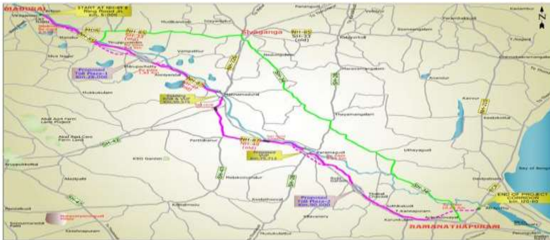
Fig.3: Project Corridor Mathurai- Rameswaram NH-49